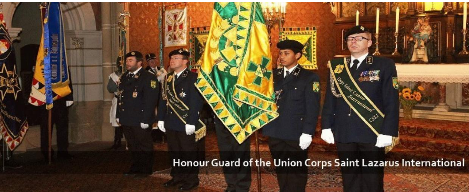
Honour Guard of the Union Corps Saint Lazarus International