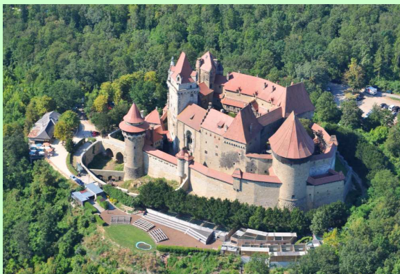
Kreuzenstein Castle, home of the Lazarus Union

Or free time to discover the city Yourself !