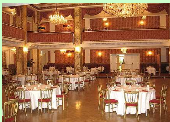
Grand ball room **)