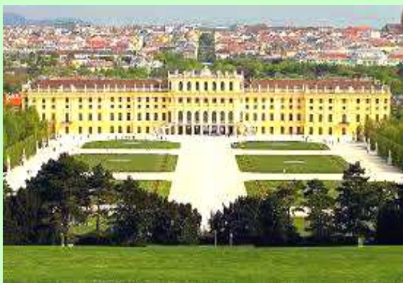
Imperial Palace Schönbrunn