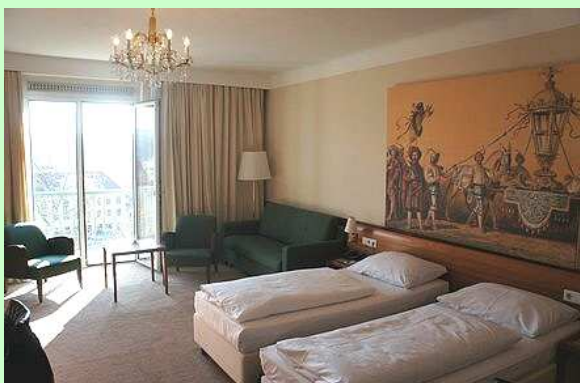
Room sample **)

September is the main season in Vienna and (excepted May) the most beautiful month in this area. Many different congresses are hold during this time and good hotels are normally fully booked and very expensive too.