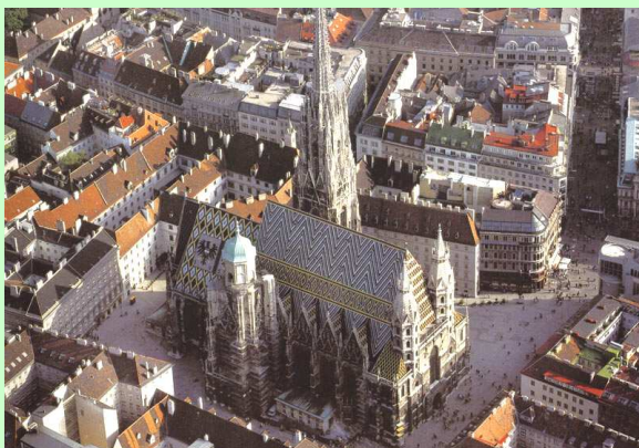
St. Stephen Cathedral