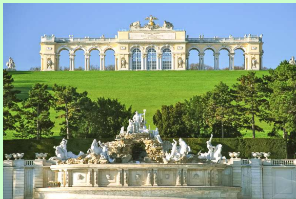
Imperial tea house "Gloriette"