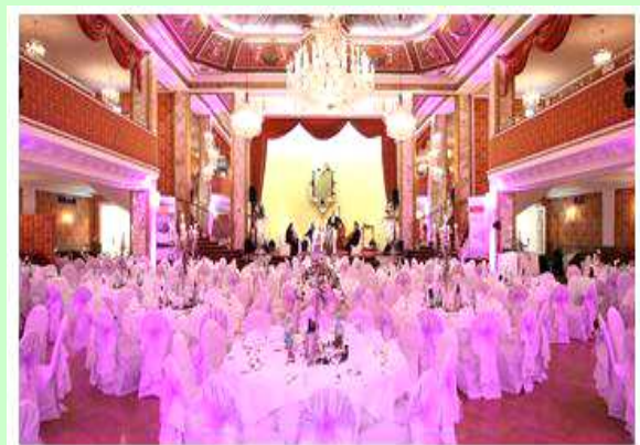
Grand traditional ballroom inside the hotel **)