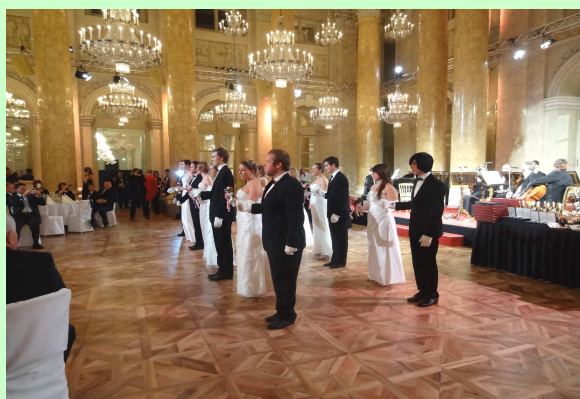
Traditional Vienna ball opening