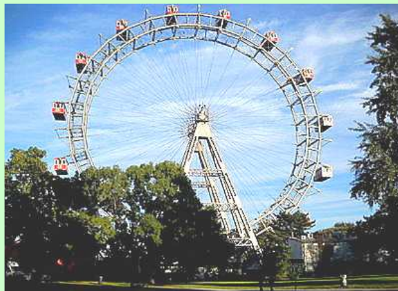
Vienna's Gigant Wheel