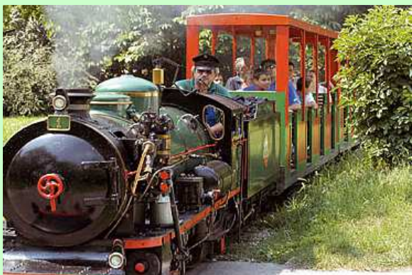
Vienna's „Liliput Train“ at „Volksprater“