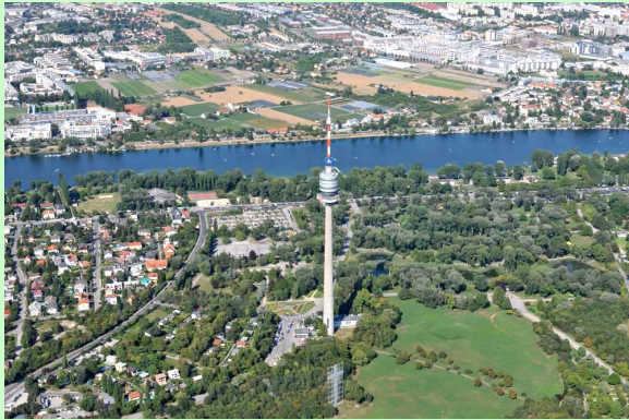
Vienna's Danube Tower