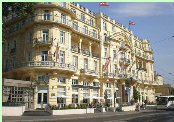
Park Hotel Schönbrunn **)

**) Pictures Copyright Austria Trend Hotels