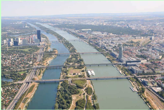
Helicopter ride over Vienna

Helicopter ride over Vienna with the CSLI Air Corps