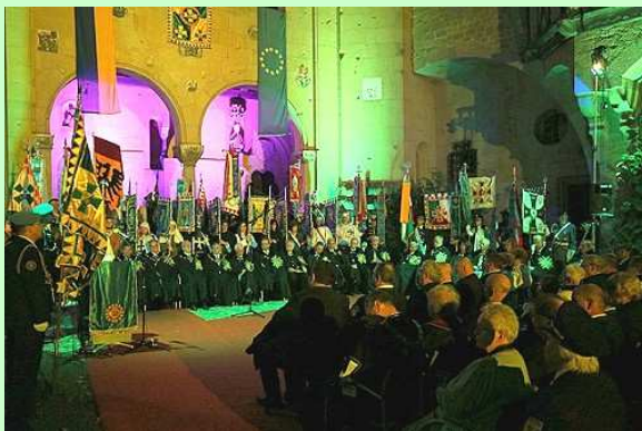
Investitur at Kreuzenstein Castle